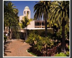
HYATT REGENCY NEWPORT BEACH

1107 Jamboree Road Newport Beach, CA 92660